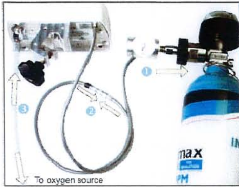
Figure 1: Page 13, Item 2, INOblender Operation Manual

Note: Check the INOblender and connection hoses for signs of wear or damage, replace as needed. Ensure white plastic tip is in place on the regulator connector and not chipped or cracked. Remove and replace as necessary. (See page 23)